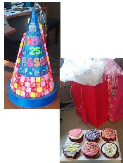
Two of our talented staff celebrated their birthdays with these personally crafted treats.