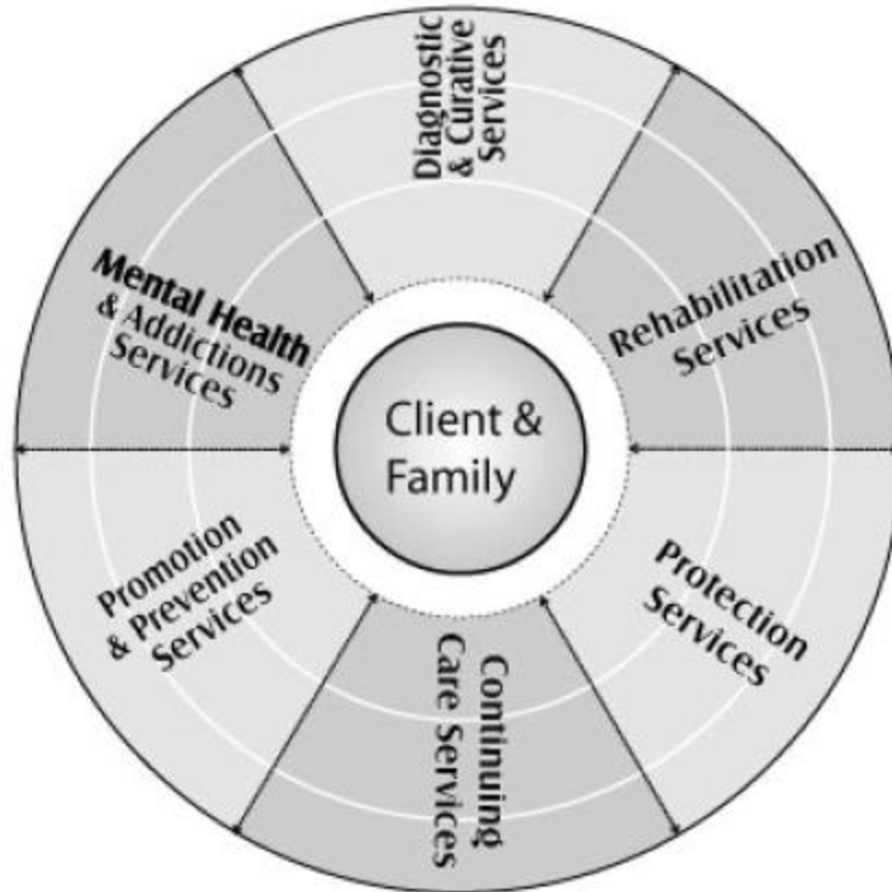
Figure 3: Integrated Services Delivery Model.